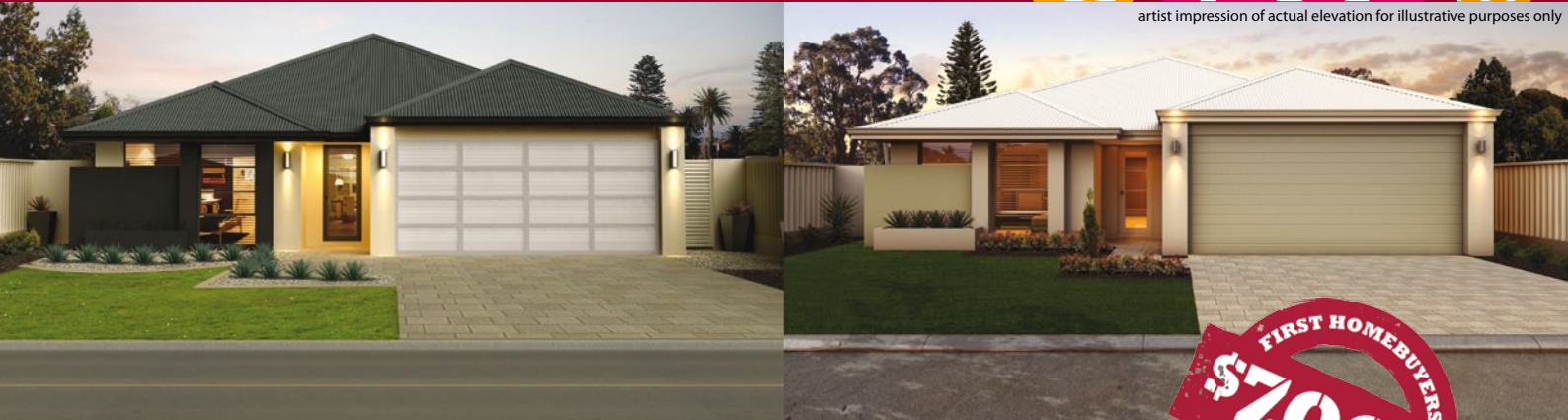
artist impression of actual elevation for illustrative purposes only